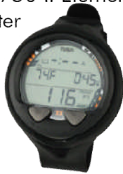
Tusa IQ750 II Element Computer

Trips are be planned for 2014 Milwaukee Wisconsin Alpena Michigan Are a couple in the works, more info in December.